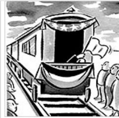
Letters: What Should the G.O.P. Do Now?