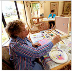
Retirees Cope With Shrinking Portfolios