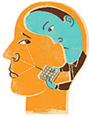
Sharing Their Demons on the Web