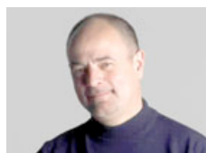
Frank Rizzo Bio | E-mail | Recent columns

TheaterWorks has entered into an arrangement with one of its first-floor tenants, Artworks, to use its gallery space as the theater's new pre-show focal point: box office area and meeting place.