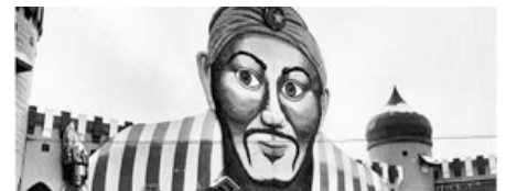
Then: Riverview: Laugh your troubles away! Now: Spectacular Chicago